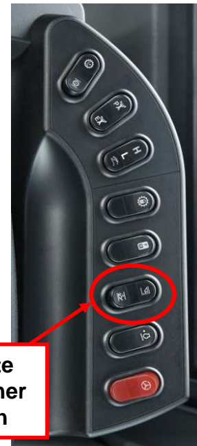
Remote positioner switch

The REMOTE BOOM POSITIONER function allows the operator to set the height at which boom travel will stop when raising or lowering the boom. The Remote Positioner Switch, located on the RH console, allows the operator to change the boom kick out positions and also to turn the function on (make active) or off (make inactive). When the Remote Boom Positioner function is active, placing the boom control lever in the raise or lower detent positions will cause the boom travel to stop at the selected kick out position. Use of this function can shorten the cycle times associated with repetitive loading applications and minimize operator fatigue.