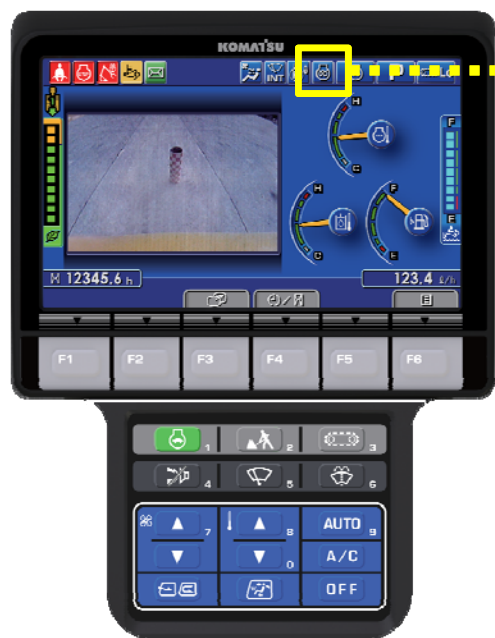
Air intake heater pilot lamp

MODEL..... PC78/88US-10, PC210-490LC-11, PC1250LC-8 FEATURE..... Air Intake Heater STD/OPT..... Standard SUGGESTED SETTING.... As Required