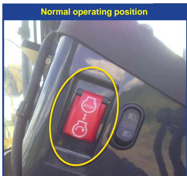
Normal operating position