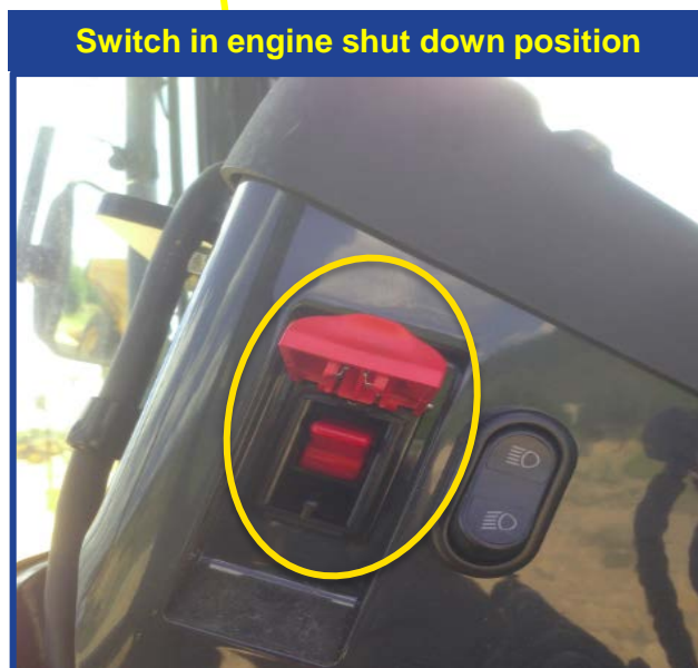
Switch in engine shut down position

For additional information, please consult the Product Bulletin, Operator's Manual or Shop Manual. Photos may include optional equipment.